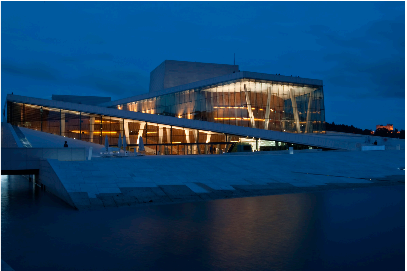
Love Nordic design and architecture? No better place to see it. Here from the Opera building by Snøhetta.