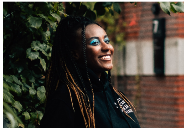
Our campuses are the most centrally located in Oslo, in the Old Town Kvadraturen and the hip Grünerløkka district, in one of the world's 10 best coffee cities according to the USA Today.