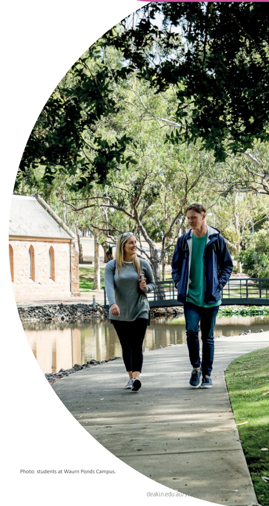
Photo: students at Waurin Ponds Campus.

For information on DUELI's fee refund policy, please see deakin.edu.au/dueli .