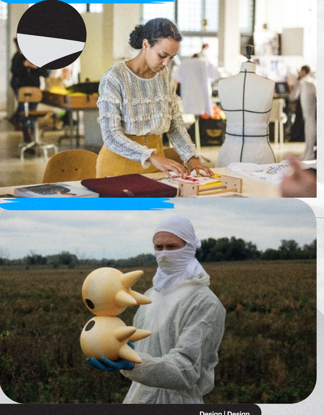
Design | Design