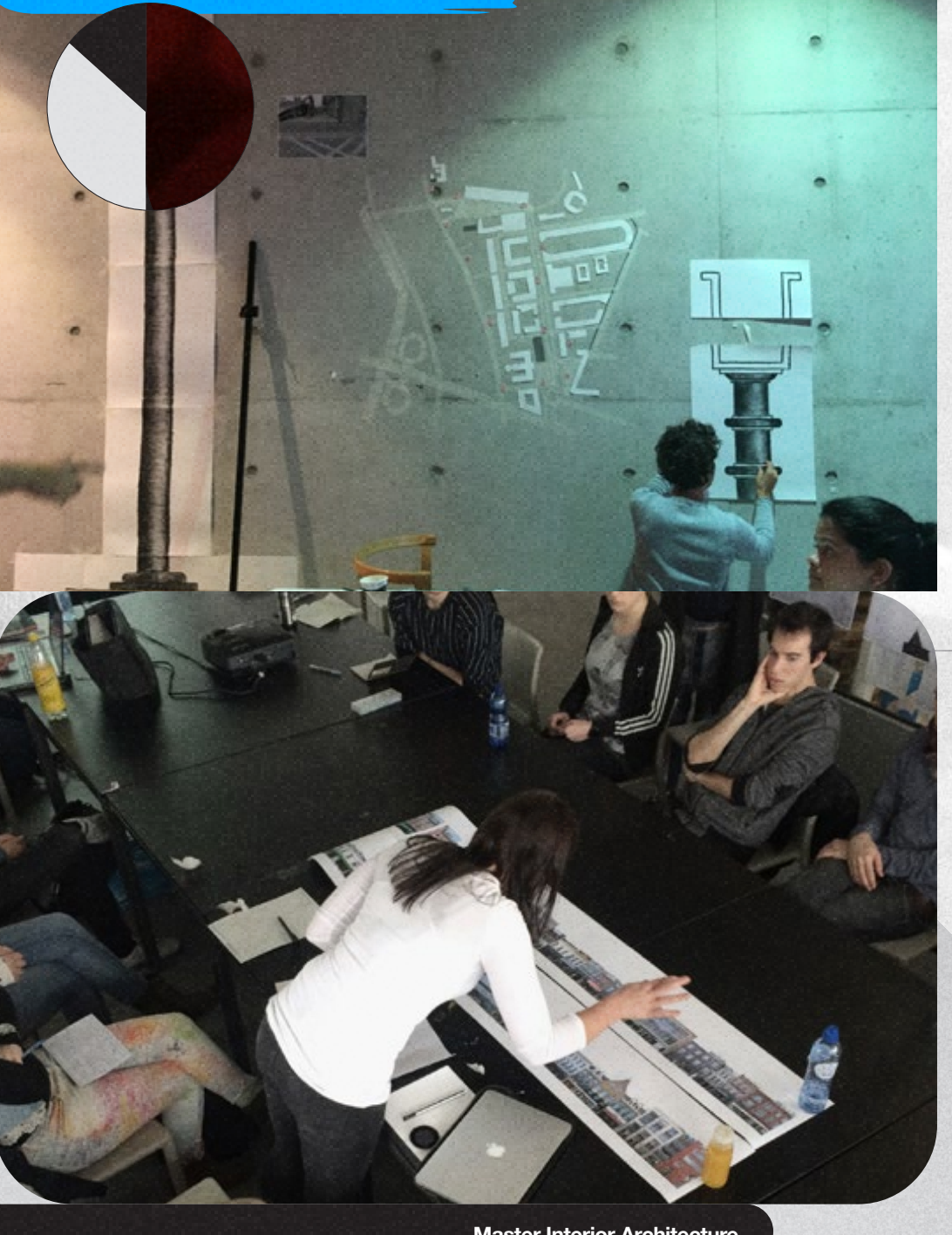
Master Interior Architecture